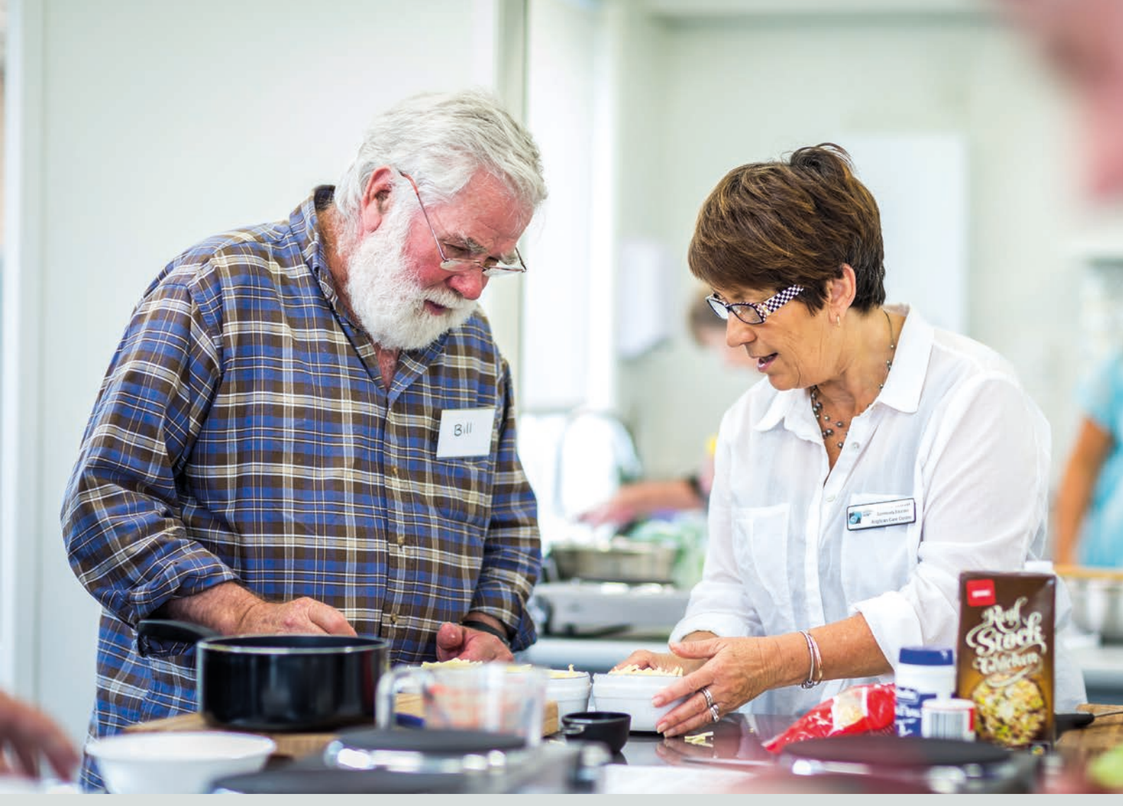
Cooking for one can be a challenge. The Selwyn Foundation has provided funding for practical cooking classes for older people living at home.