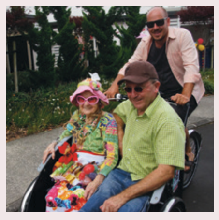
A Cycling Without Age volunteer at Selwyn Village's annual Children's Day Carnival shares the joy of cycling on trishaws.

We are extremely grateful for the valuable contribution made by our volunteers and for the time and energy they devote to enriching the lives of all those they connect with. Each year, we celebrate their involvement during National Volunteer Week, with 'thank-you' events at each of our villages and dementia day centres to recognise their valuable contribution to Selwyn's work and mission.