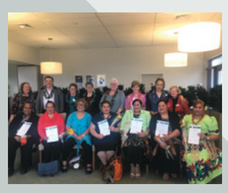
Celebrating success in this year's 'Communicating in the Workplace' course.

The opening of the Lees and Moxon care centres and the introduction of the household environments (see further under 'Villages') have also been the catalyst for more experiential staff training held in-situ. Practical, interactive - and fun - training sessions within supportive peer groups have inspired staff in adopting the new culture and behaviours that the participatory care model has required. This,