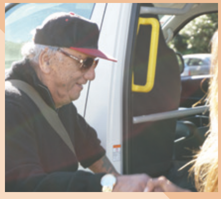
'All aboard!' A Haumaru Housing tenant climbs aboard for a shopping trip in one of the new

With these and other exciting initiatives in the pipeline, the Foundation is providing practical solutions delivered 'on the ground' that are helping older people overcome the big and small hurdles they face with ageing, thus preventing or delaying a transition to residential care in the longer term.