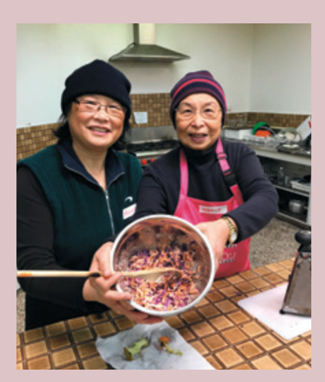
Participants at the JUST COOK 4 Healthy Ageing' session at St Luke's in Manurewa.